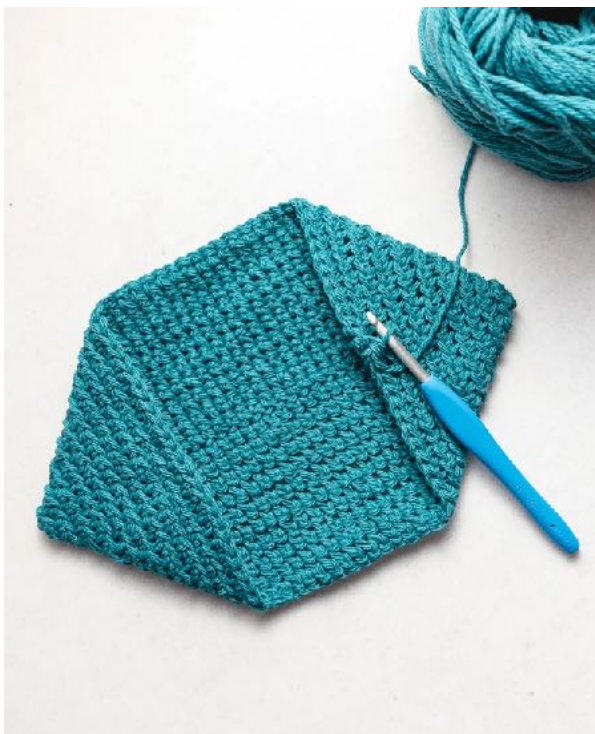
As you keep working, the edges will fold into the center to create a diagonal seam.