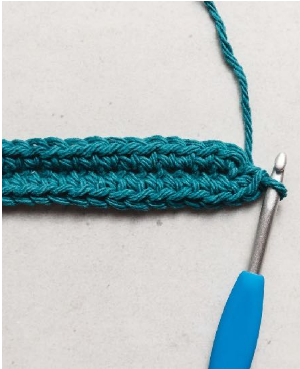
End of Round 1.