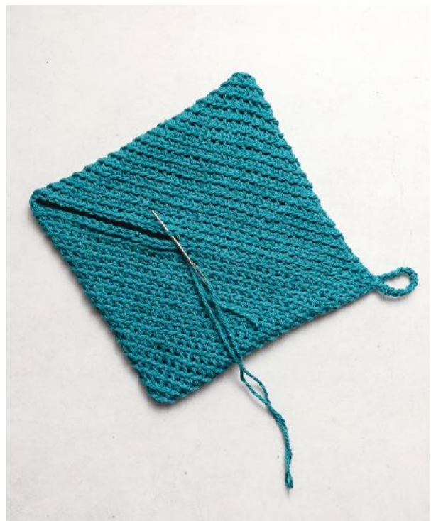
Sew the seam with a mattress or whip stitch.